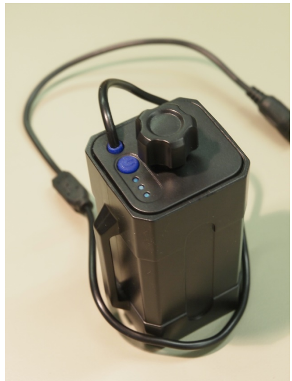
Figure 1. Lithium-Ion 18650 Protected Four-Cell Battery Holder, PN: 1.40.